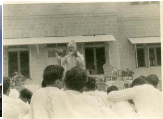
Hazrat Maulana Muhammad Ali addressing a crowd.